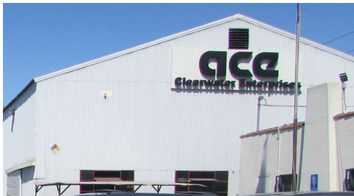
Facing Garfield Avenue