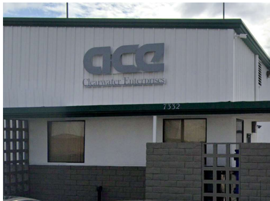
Facing Quimby Street

Signs: Section 17.36.030 includes provisions for a wall sign to be installed in compliance with M-2 sign regulations. The subject site contains three channel letter wall signs – two facing Quimby Street and one facing Garfield Avenue.